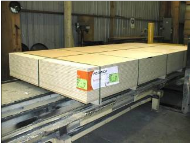
Pic. 9 Particle board with (belly strap)