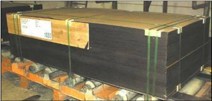
Pic. 6 Plywood pack