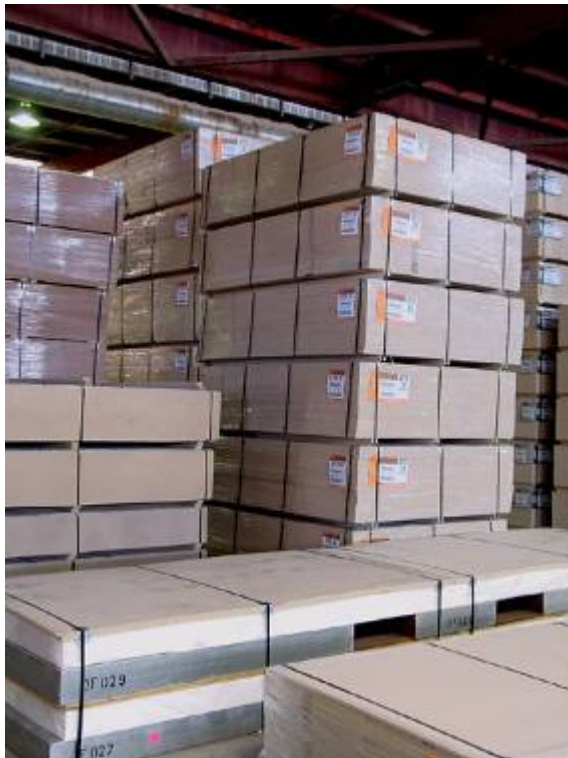
Pic. 1 Steel strapping