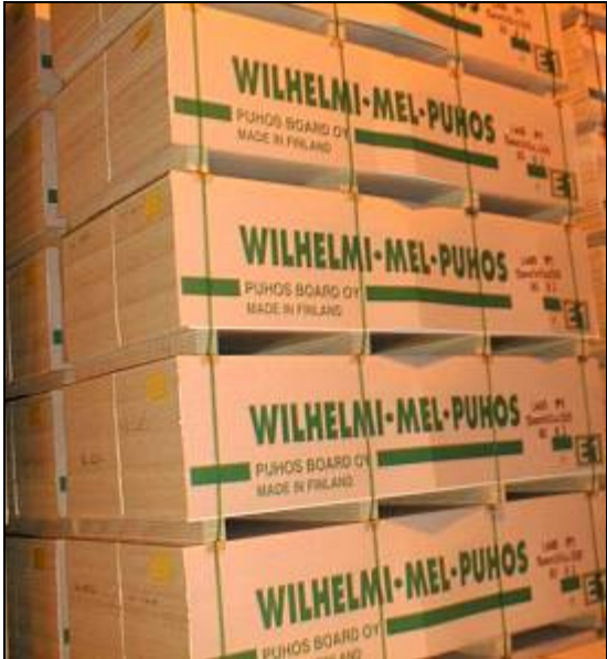
Pic. 7 Particle Boards