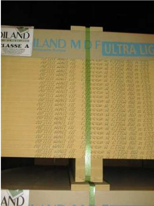
Pic. 3 MDF with bunk and top board and corrugated sheet protection