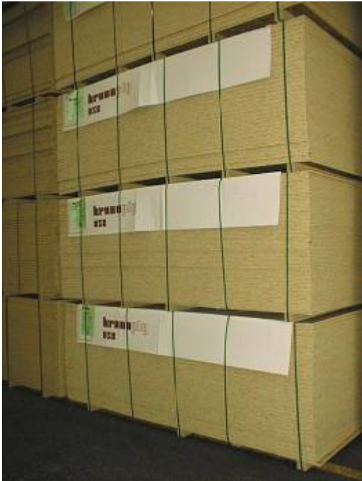
Pic. 5 OSB with bunk and top scrap boards