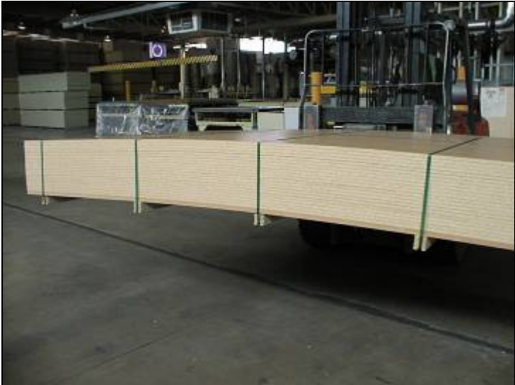
Pic. 8 Test with long pack