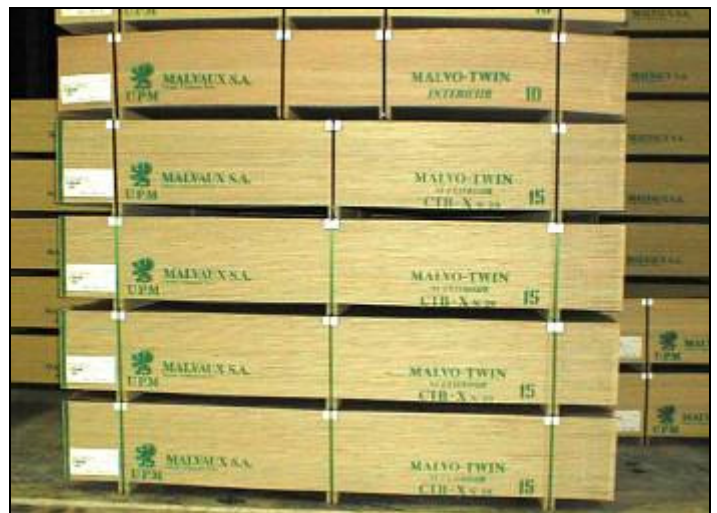
Pic. 2 Steel and PET mixed