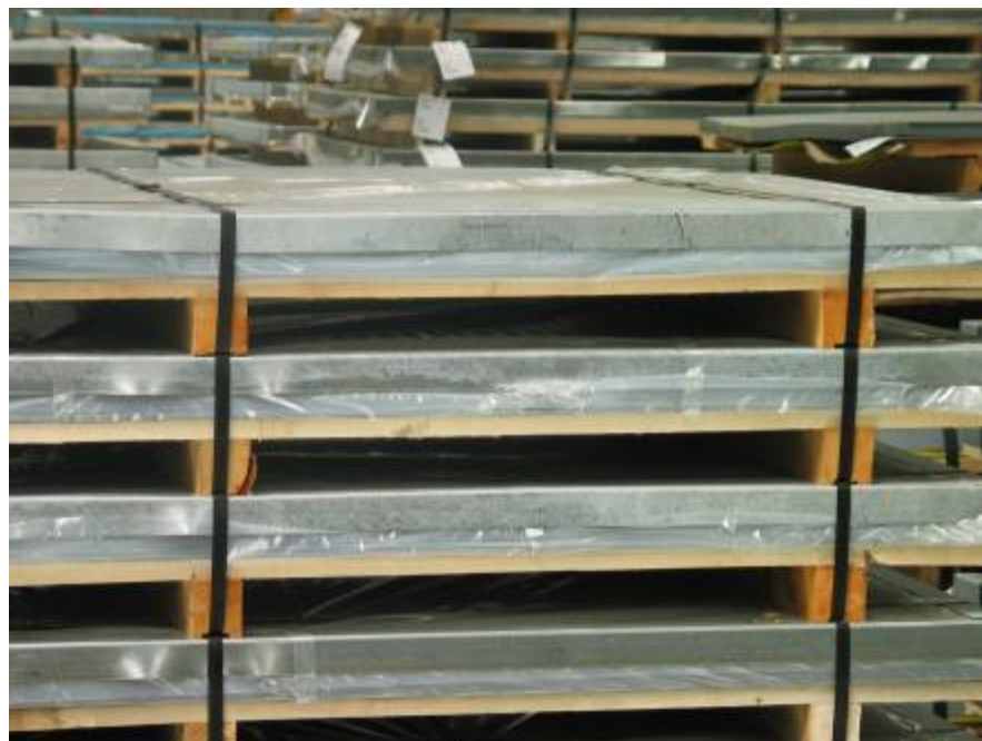
Galvanized packs protected with stretched film and steel corner