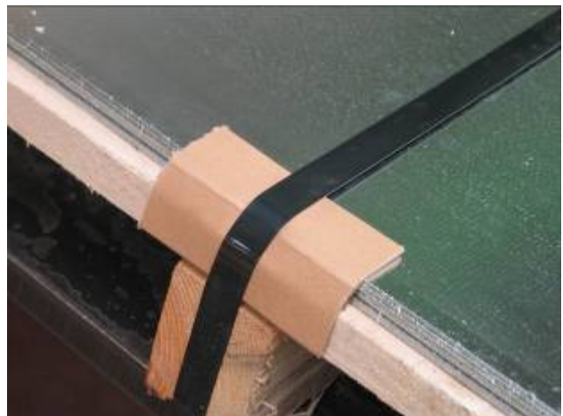
Black PET with corner protection