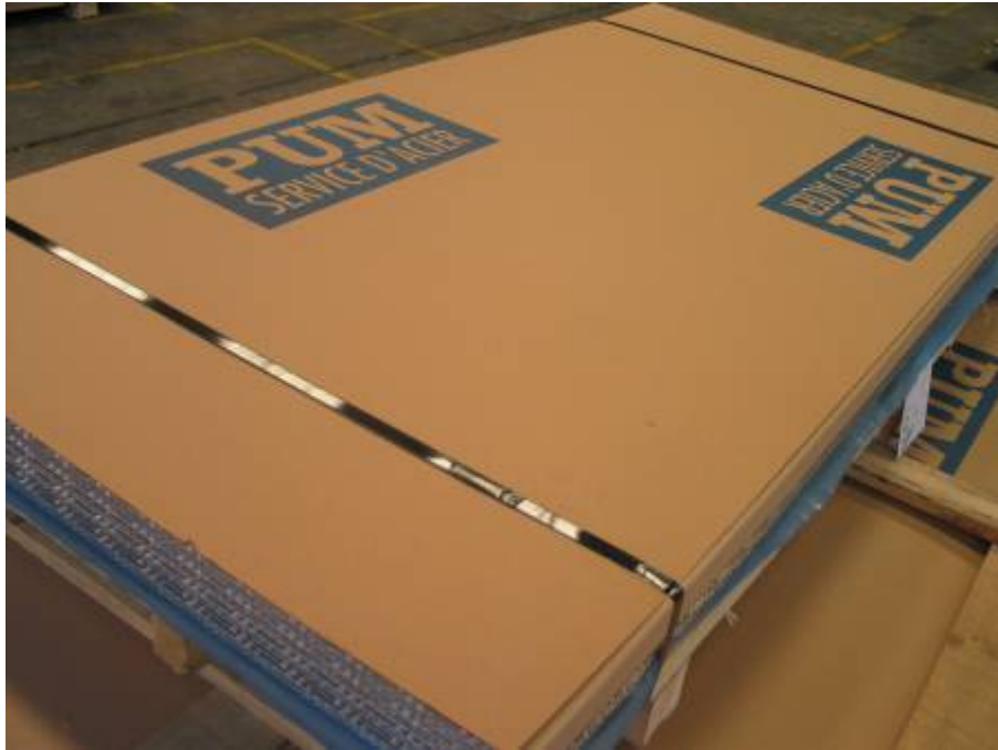
steel plates pack covered with carton board protection