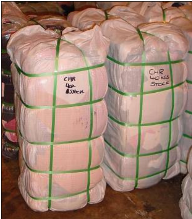
Large and small Textile Bales secures with PET strapping