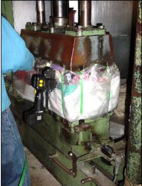
Strapping in press with P321