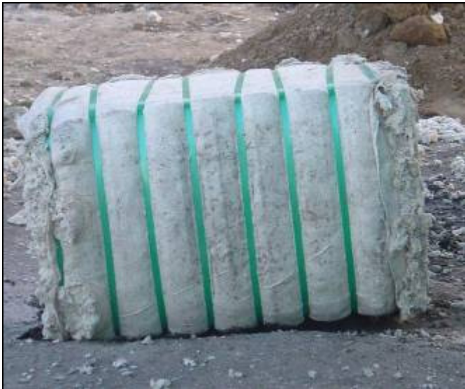
No broken straps!