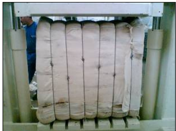
Steel hook wires (quick links)