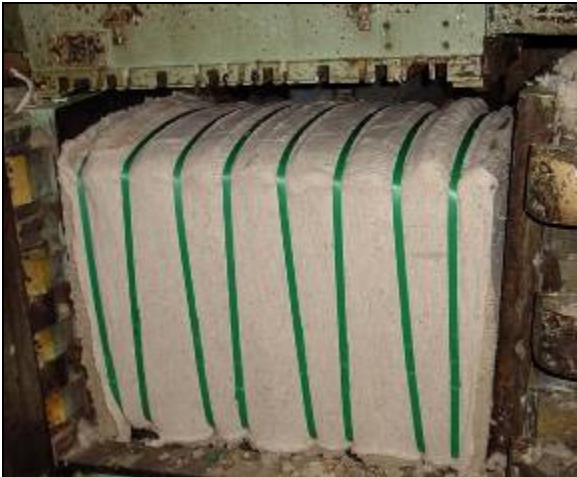
Press opens, straps are tensioned

Secured with FROMM P323 or P356 tool and PET strapping