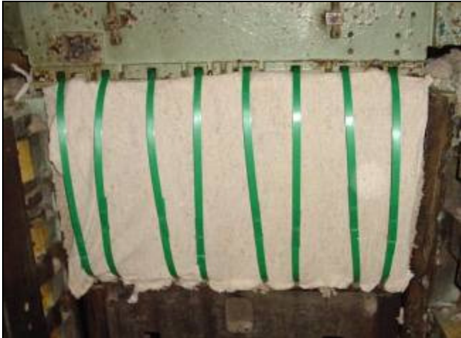
6 straps sealed loosely in press