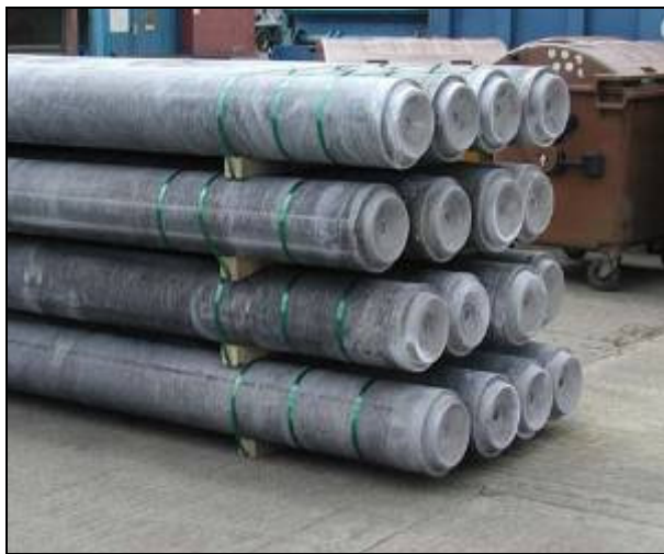
Pic. 4 Large billet Ø