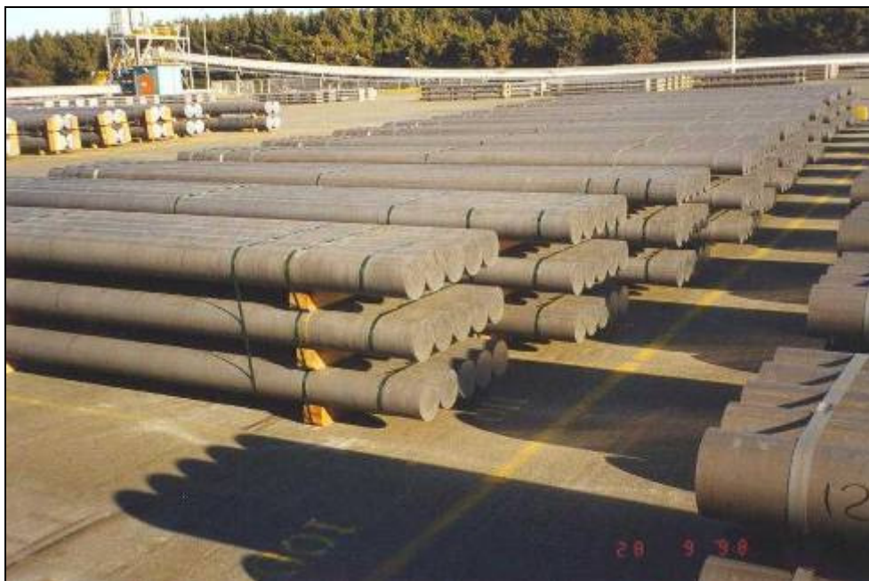
Pic. 1 Strapping of long packs