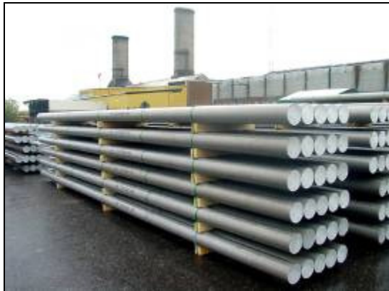
Pic. 2 Two layer stacking