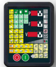
TOUCH 11" OP Touch screen