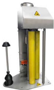
CA6-E Carriage, F335