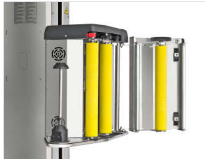
CA6 / CA7 Carriage, Ultra fast ergonomic film infeed. Knife cut-resistant vulcanized rolls, low maintenance with limited wear & tear